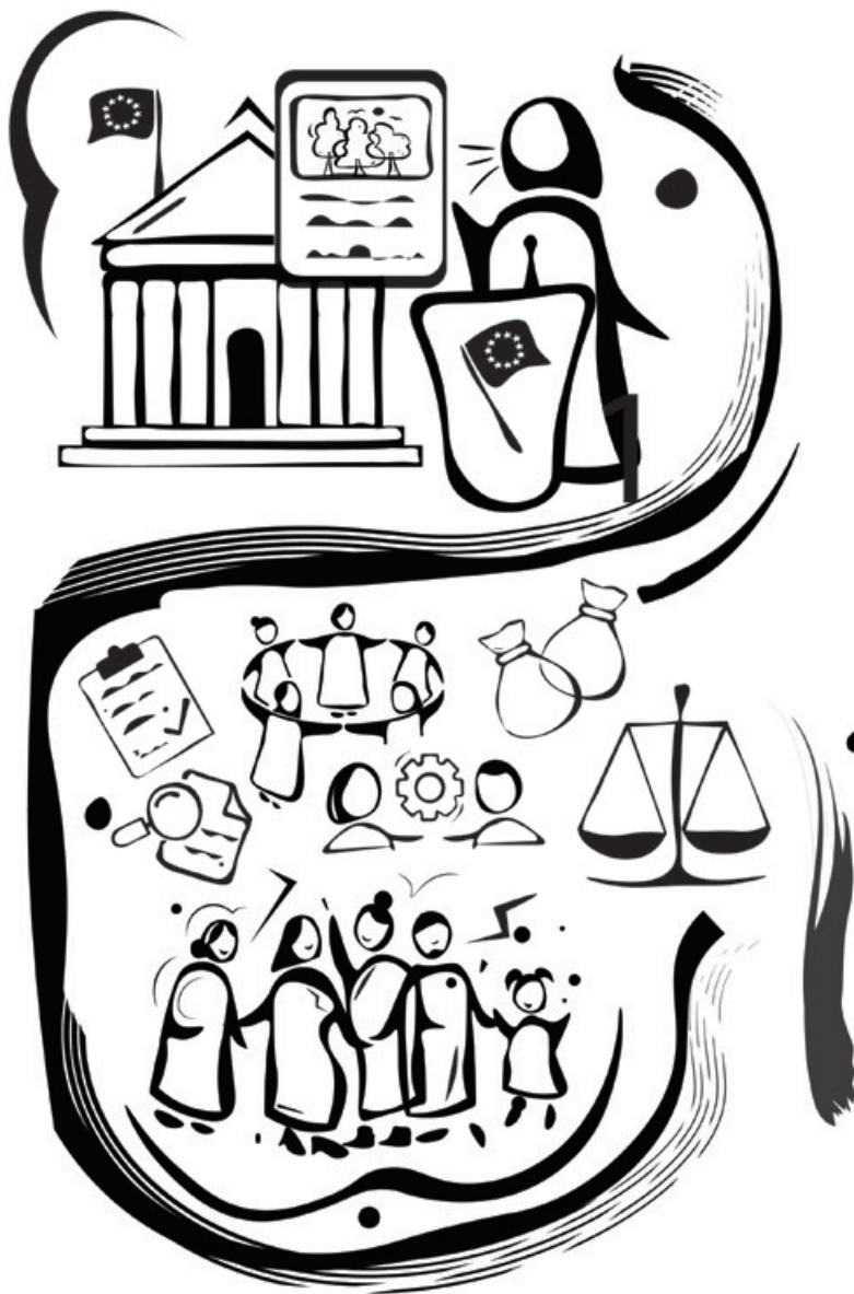
Visualisation of main policy message